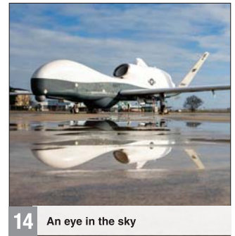
14 An eye in the sky