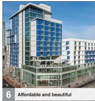
6 Affordable and beautiful